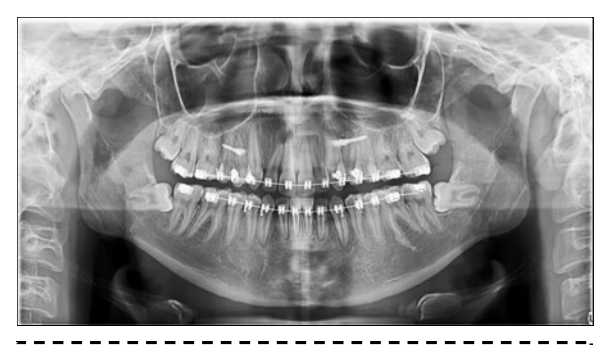
Figure 6. Panoramic X-ray before the removal of the third molars.