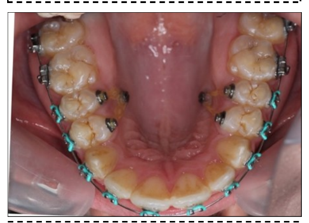
Figure 5 . Intraoral photography after the mini -implant activation