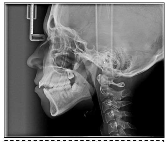
Figure 2. Pretreatment cephalometric

The cephalometric analysis indicated that she had a skeletal class II profile ,proclination of the maxillary central incisor ,high mandibular plane angle that contributed to the class II skeletal relationship and increased lower facial height.