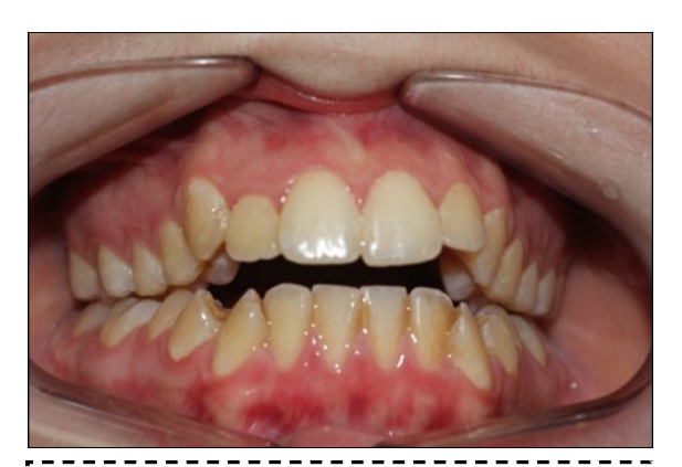
Figure 1. Pretreatment intraoral photography

The patient, a 21-year old woman , had a convex profile , class I dental malocclusion ,anterior open bite of 4 mm . She was a mouth breather and presented tongue thrust. Her chief complain was the anterior open bite .(Figure \bf 1 )