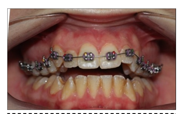
Figure 4. Intraoral photography at the start of the treatment.