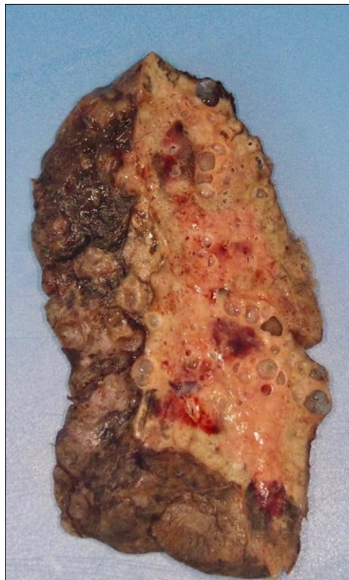
Figure 2. Damaged lung removed following transplantation. Northwestern Medicine