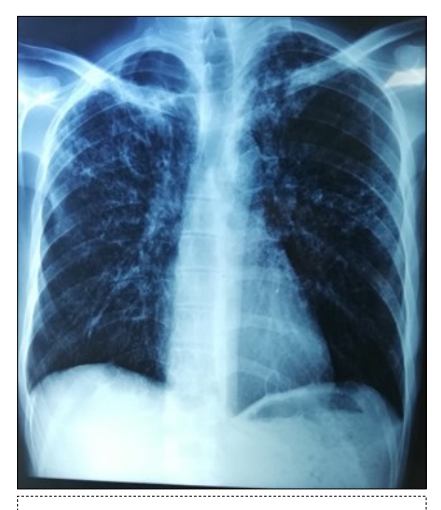
Figure 1. Pneumoperitoneum on chest X Ray

The histopathologic examination of the resected bowel specimen showedcaseating granulomatous inflammation (Fig-2), consistent with intestinal small