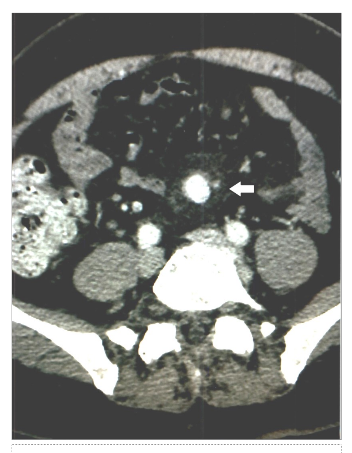
Figure 3. Case 3 – Superior Mesenteric Artery Branch Aneurysm surrounded by a halo.