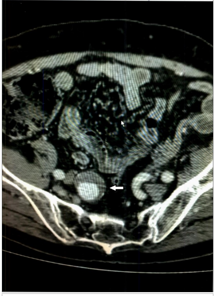
Figure 1. Case 1 - Right Internal Iliac Aneurysm

Complete metabolic panel was normal with normal hemogram. Immediate computed tomography (CT scan) revealed a 1.5 x 2 centimeter mesenteric aneurysm, possibly ruptured, Figure 2, as well as two