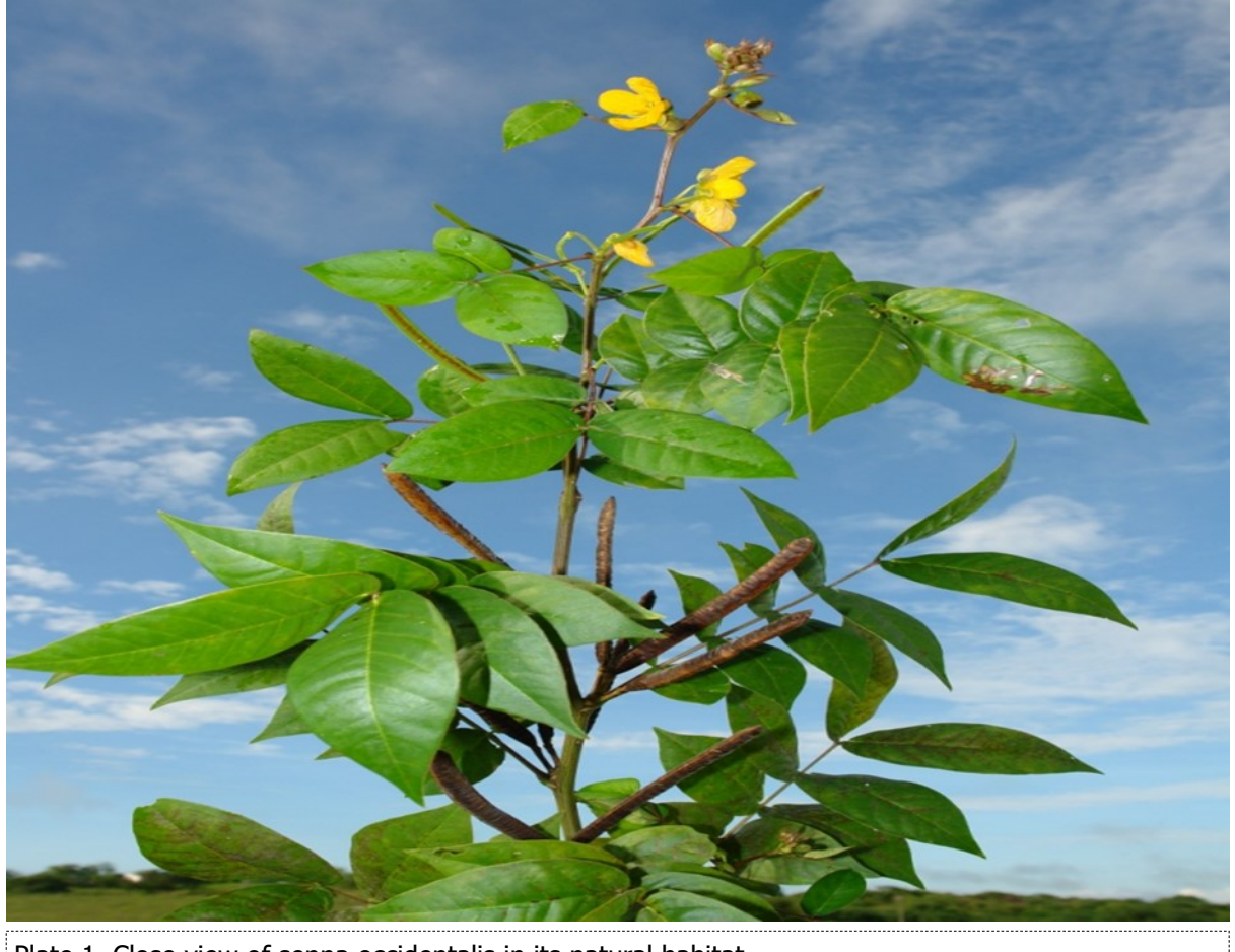
Plate 1. Close view of senna occidentalis in its natural habitat